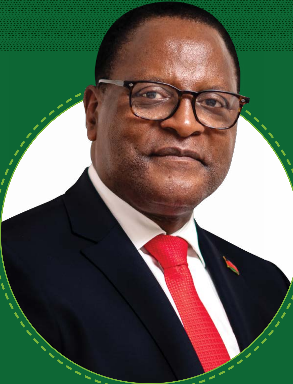
DR. LAZARUS MACCARTHY CHAKWERA PRESIDENT OF THE REPUBLIC OF MALAWI